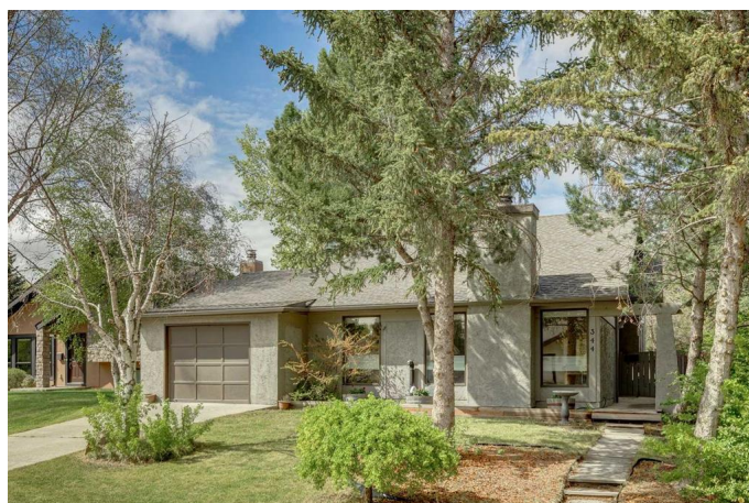
344 Oakwood Pl SW, Calgary, AB

2nd Floor Main Exterior Area 586.69 sq ft Interior Area 549.59 sq ft Excluded Area 323.52 sq ft