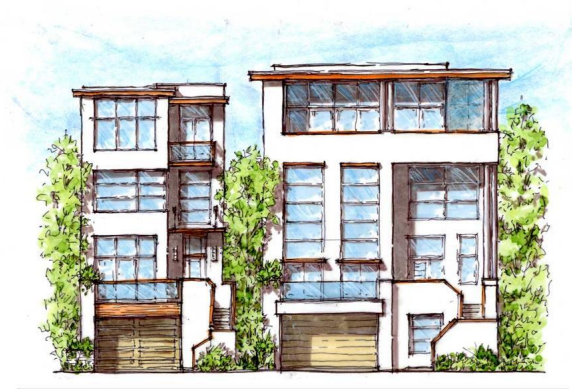
OPTION 2: SUBDIVISION INTO 2 LOTS