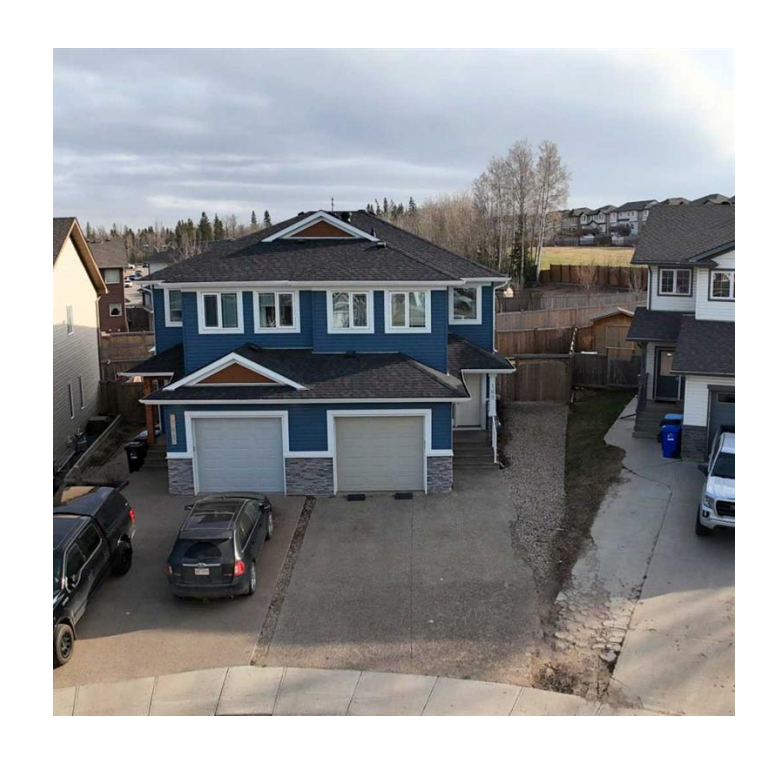
169 Shalestone Way, Fort Mcmurray, AB

Upstairs, you'II find TWO primary bedrooms, each with its own ensuite! The main bathroom is a 4-piece ensuite for the second bedroom. Amazing dual function and perfect for guests or a growing family. There is a third bedroom upstairs, also great for