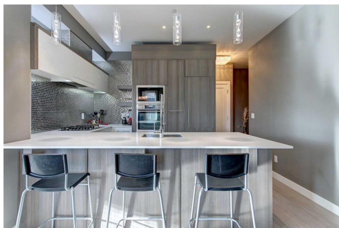
308-119 19 St NW, Calgary, AB

Welcome to Savoy by Truman Homes, where urban convenience meets contemporary style! Nestled in the heart of Kensington West, this vibrant community offers an incredible lifestyle—step outside to explore charming boutique shops, restaurants, bistros, and delis. Enjoy easy access to transit, the Bow River pathways, Kensington Village, and downtown, plus a well-established neighborhood with schools, parks, playgrounds, and more! This bright and unique corner unit boasts south east-facing exposures, flooding your space with natural light. Step into a welcoming entryway with a closet, leading you to a sleek, modern kitchen featuring high-end appliances, quartz countertops, and custom cabinets. The open layout flows effortlessly into the dining and living areas, the perfect spot to relax, with access to the south-facing balcony. The spacious primary bedroom features a luxury ensuite pampering you with a deep soaker tub, a large standing shower, and a stunning Kohler glass vessel sink. The flexible second bedroom is thoughtfully placed on the other side of the unit for added privacy. The spa-inspired main bathroom includes a huge walk-in shower and stylish glass vessel sink. Plus, the in-suite laundry offers additional storage and organization. Enjoy the added perks of a rooftop patio, secure titled underground parking, a separate storage locker, and bicycle storage. This stunning home is move-in ready—come experience the best of Kensington living today!