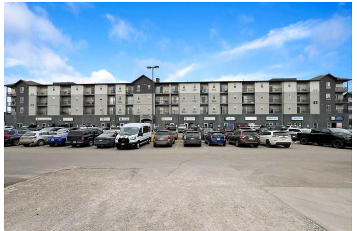
The Location - Downtown Fort McMurray

This excellent downtown retail development presents a rare opportunity for businesses